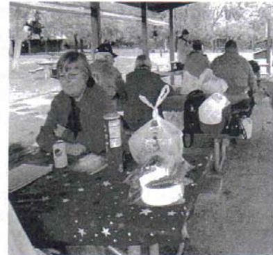
..... AND WE ATE.