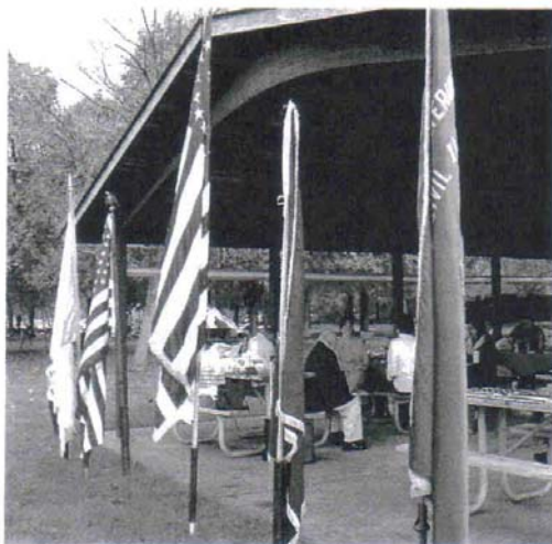
... AND WE SHOWED OUR COLORS.